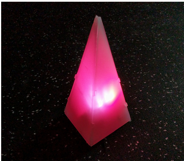
Figure 1: AUI indicating negative BTC value change, one day.

This object is an implementation of ubiquitous computing with industrial design and the use of light to transmit information; an AUI. The object is to be placed in an environment where it can be monitored peripherally. Using the ESP8266 microprocessor, with Arduino software, current and historical BTC value data is gathered from the coindesk.com API by WiFi. Data is evaluated and used to control the LEDs. The design of the object, using a pyramid form, semi-transparent acrylic, and shoji (fiberglass) paper is influenced by the work of Thomas Wilfred (1889 – 1968), who used light in ‘lunia’ performances and stand-alone artworks. [Betancourt, Michael 2006]